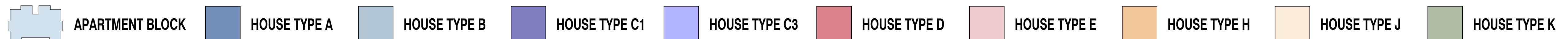
STAND & HOUSE TYPE SCHEDULE (BY TYPE)